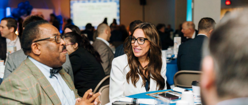
TABLE PARTNER* | $1,200